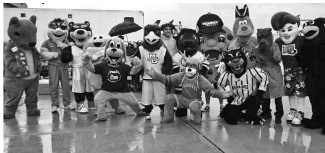
The Mascots posed before their Pull.