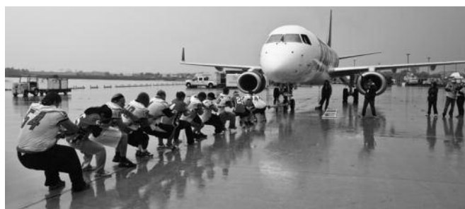
Loyal Plane Pull supporters and past champions, The Muskego Hitmen, give it all they've got. They finished third at 5.5 seconds for the 15-foot pull. The winning time was 5.1 seconds by Grand Electric. The Young Adult Cancer Survivors team finished second with a time of 5.4 seconds.